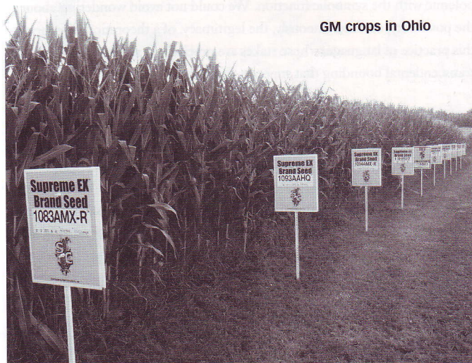
GM crops in Ohio

companies leave more than enough and as good for others to use (depending on how we choose to interpret the proviso). In other words, while the former would come to own some individual thing which is exclusive and finite, and would therefore worsen the situation of everyone else, the biocompanies claim ownership over a type of thing, where there are thousands of other types left free for everyone else to use.